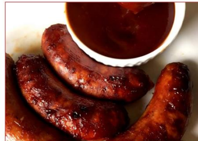
Spicy Sausages & Homemade BBQ Sauce