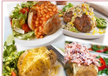
Jacket Potato ⓘ

to go with Lime & Coriander Rice JNR, Green Beans JNR, Sweetcorn JNR.