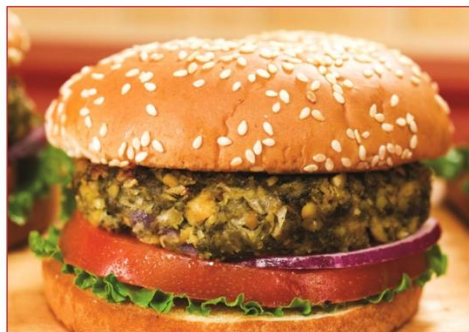
Falafel & Spinach Burger