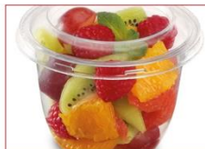
Fresh Fruit Pot ⓘ