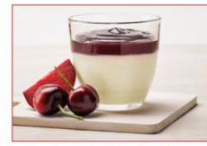
Homemade Yoghurts ⓘ