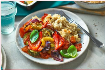
Baked Ratatouille ⓘ

Please select your Main Meal choice by clicking on the image below. (All meals come with optional salad)