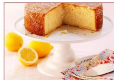
Lemon Drizzle Cake ⓘ

Finally select your Pudding choice by clicking on the image below.